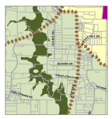
Figure 6. Example of a parcel-based Future Development Map that includes a category for the floodplain (in dark green) and shows/labels roads

The term "essential facilities" is another term used in hazard mitigation planning. Essential facilities are, generally, a subset of critical facilities that include: medical facilities, police and fire stations, emergency operations centers, evacuation shelters and schools, and other structures that house first responder equipment or personnel.