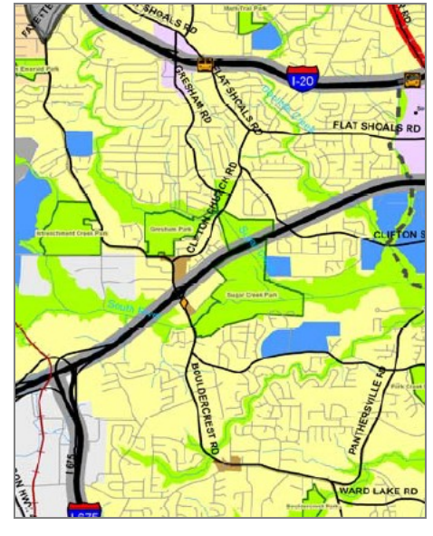
Figure 3. The floodplain is included in the DeKalb County Future Development Map (shown in light green, part of the "Conservation/Greenspace" character area)

Many hazard mitigation plans also do not effectively incorporate land use mapping. Coordination of land use mapping and potential natural hazards analysis is critical to reducing damage and making communities more disaster resilient. This coordination can be achieved by preparing hazard mitigation and comprehensive plan updates at the same time to ensure mapping consistency. If plan updates occur at different times, it is important to include the most recent version of the community's future land use/development map in the hazard mitigation planning process.