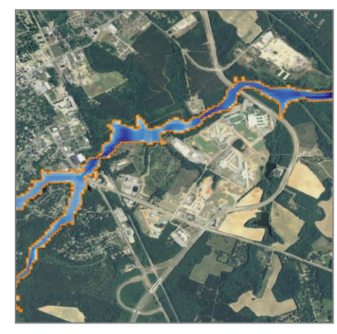
Figure 4. DCA can generate flood depth grids to illustrate the potential extent of flooding in a community

When preparing an update to the comprehensive plan, the County should incorporate discussion of natural hazards that are addressed in its hazard mitigation plan. Discussion about natural hazards should occur in public meetings conducted during the planning process, and results should be reflected in the plan itself, either in the Needs and Opportunities section or by the addition of a Hazard Mitigation element. The hazard identification process brings forth an awareness of the impact natural hazards pose to the health, safety and welfare of the community. Bringing hazard identification into the