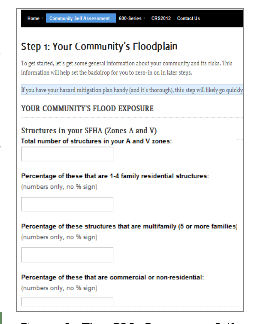
Figure 8. The CRS Community Self Assessment is a tool that can help communities develop programs and identify CRS activities most appropriate for their particular flood risks

Under the CRS, communities can be rewarded for doing more than simply regulating construction of new buildings to the minimal national standards. The CRS Program results in a community's residents' flood insurance