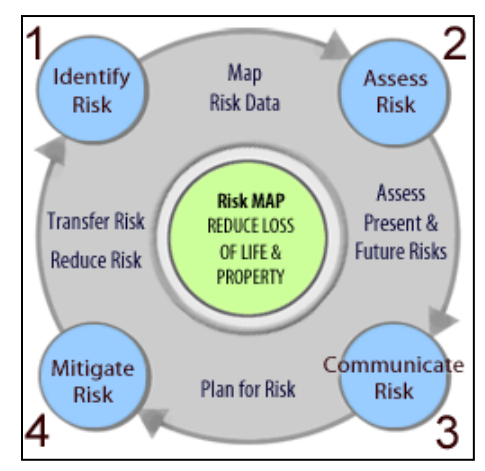
Figure 5. FEMA's Risk MAP (Mapping, Assessment & Planning) lifecycle illustrates the process of identifying risks by utilizing flood hazard mapping and data