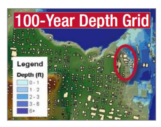
Figure 1. Example of Use of Depth Grids in Floodplain Mapping (not DeKalb County)

The detail and quality of the maps in hazard mitigation plans and comprehensive plans is an important factor in effectively demonstrating potential dangers to homes, businesses and critical facilities. This is especially true for floodplain mapping, where depth grids can indicate the potential depth of water on an individual property (see Figure 1), offering greater detail and information about potential risk. At a minimum, a community's current Flood Insurance Rate Map (FIRM) should be used in hazard mitigation planning and comprehensive planning to depict floodplains, ideally with parcels and major roads also shown on the map. identifies Special Flood Hazard Areas (SFHA), which are the areas that would be covered by waters of the base flood ("100-year flood" or ""I percent annual chance flood").