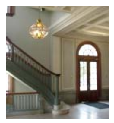
Valdosta City Hall